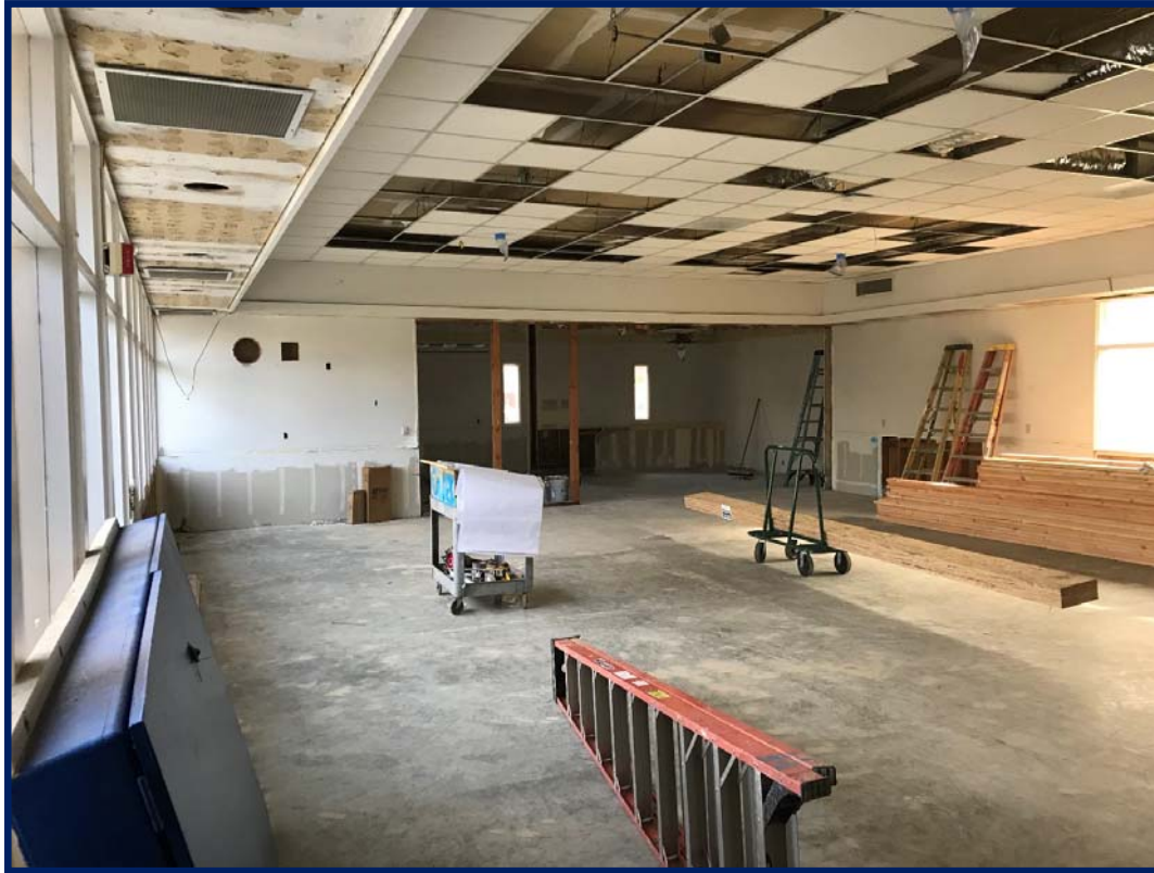
Toyon FIS – Looking East - January