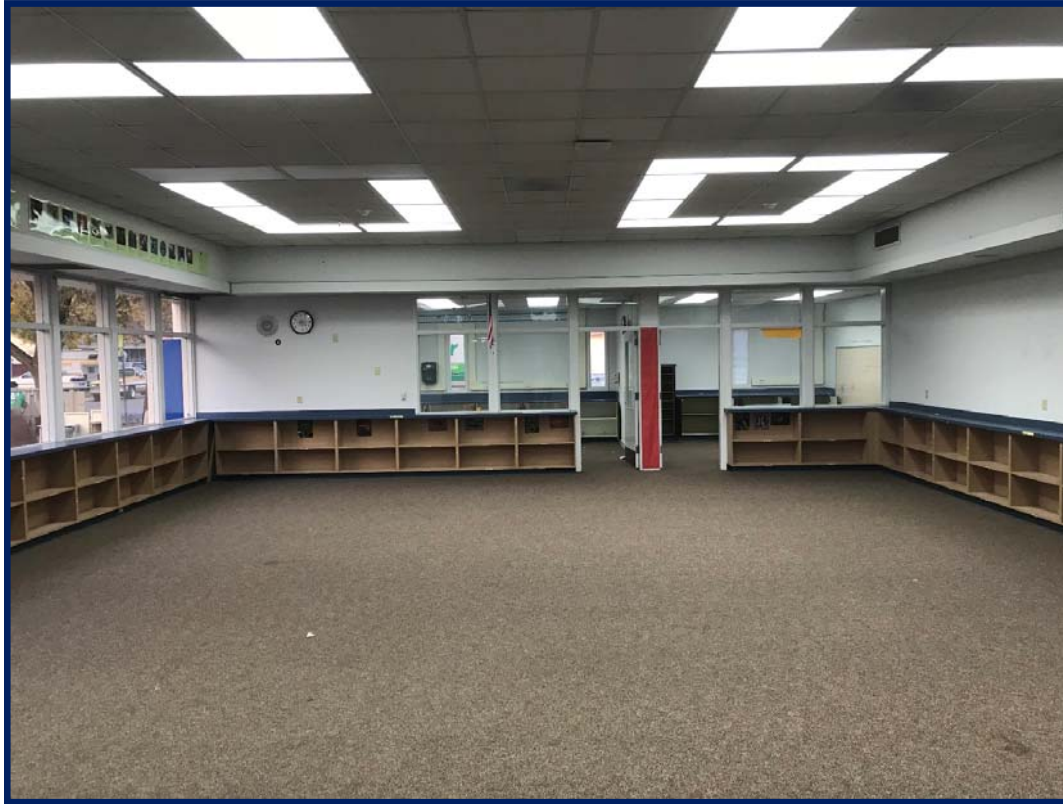
Toyon FIS – Looking East - December