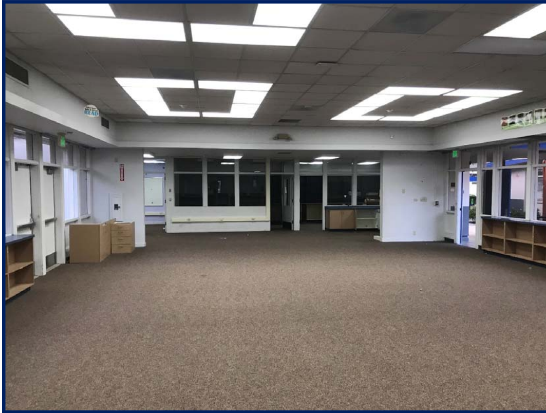
Toyon FIS – Looking West - December