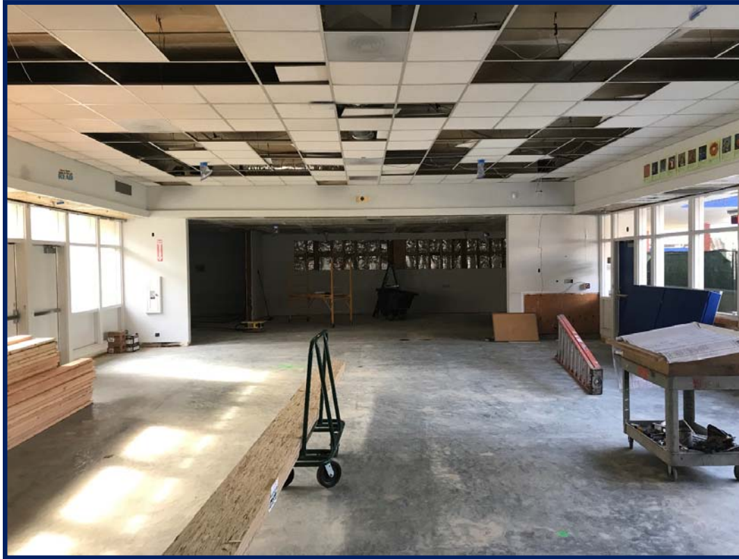
Toyon FIS – Looking West - January